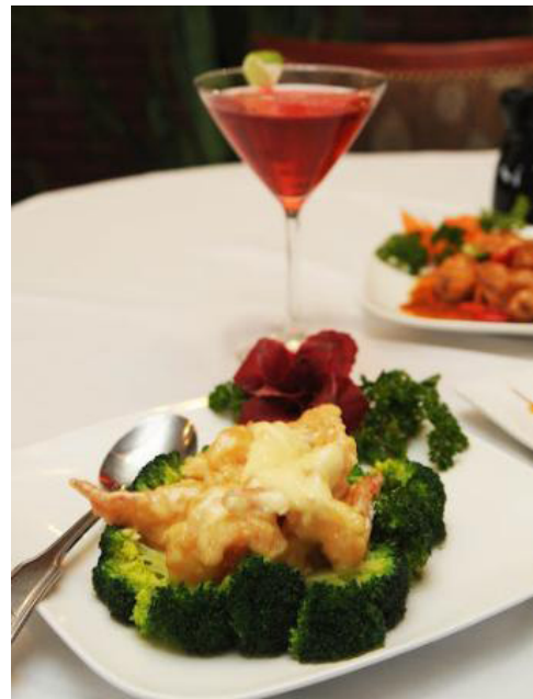
Chen Yang Li